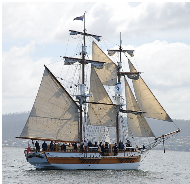
Lady Nelson at the Parade of Sail, Wooden Boat Festival, Hobart, 6 February 2009.

The MHA V committee needs new members. All of our organisations are entitled to have a representative on the committee, plus there are four other members who represent the members generally. We would love to see some new faces at our meetings, which take place about every two months. Now that progress is finally happening at Seaworks we have challenging times ahead to support the fledgling maritime centre: any assistance would be welcome.